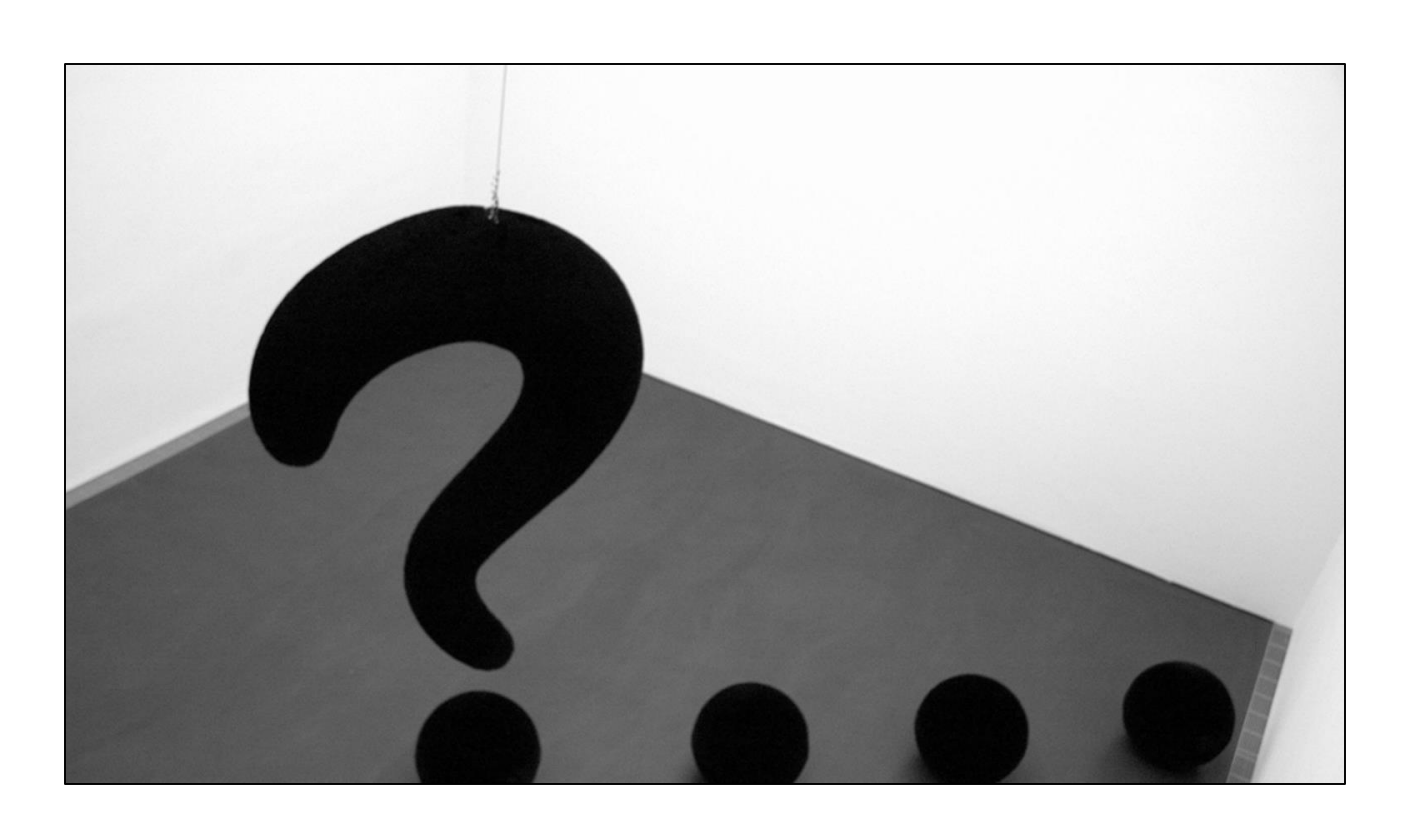
5 Minutes:Q & A